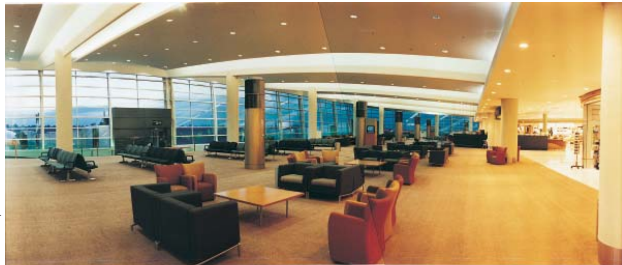
The International Departure Lounge.