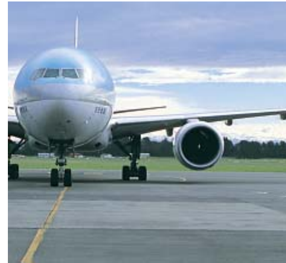
Ready for take off.