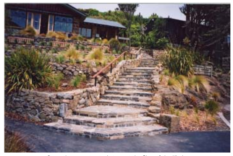
Recently reconstructed steps at the Sign of the Kiwi.