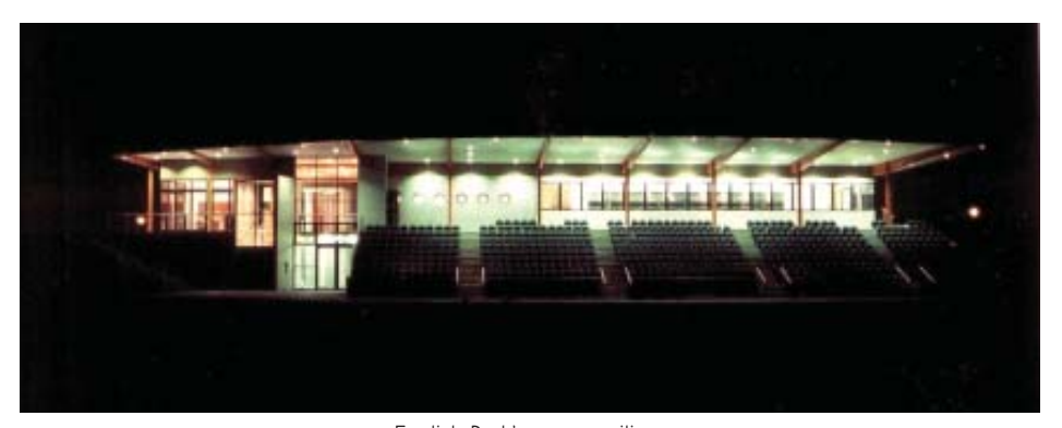
English Park's new pavilion.