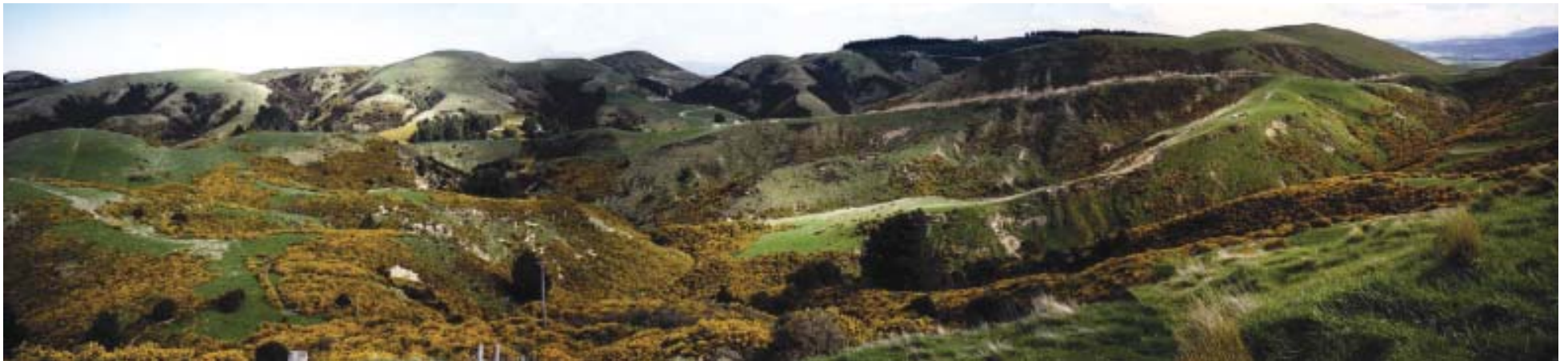
Potential regional landfill site in Upper Kate Valley.