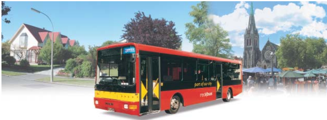
A bus from the Red Bus Ltd fleet - one of the subsidiary companies of CCHL.