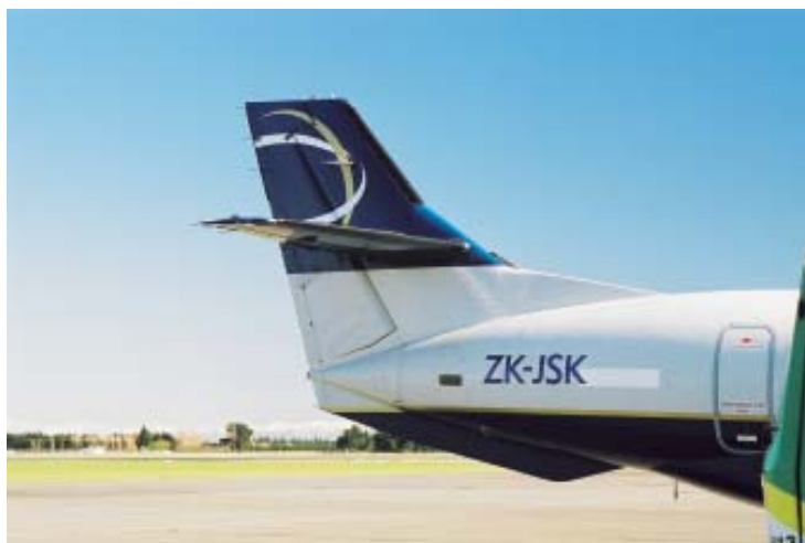
A runway scene at the Christchurch International Airport Co Ltd. Christchurch City Holdings Ltd holds 75% of the shares in this company.