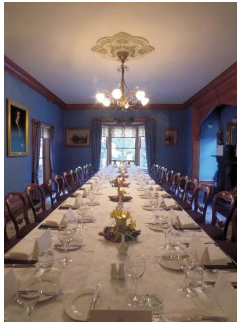
The recently refurbished dining room, Riccarton House.