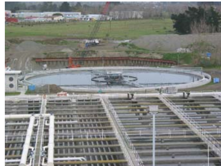
Construction continues at the Christchurch Wastewater Treatment Plant.