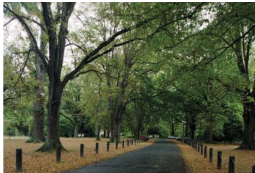
The driveway to Riccarton Bush and House.