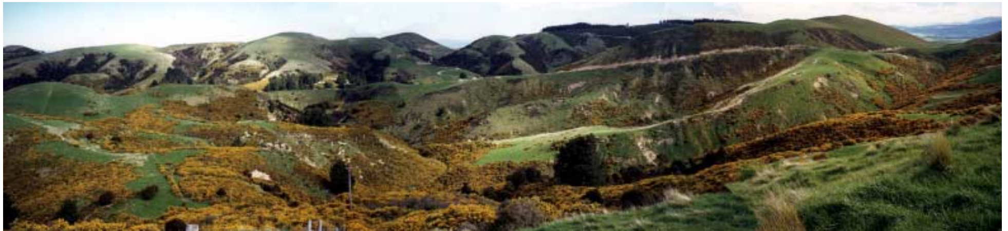
Potential Regional Landfill site in Upper Kate Valley