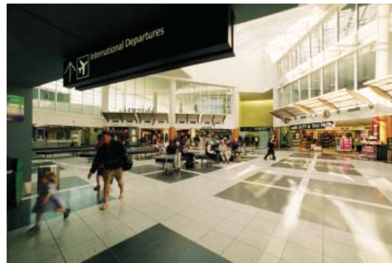
Inside the new Terminal Building at Christchurch International Airport.