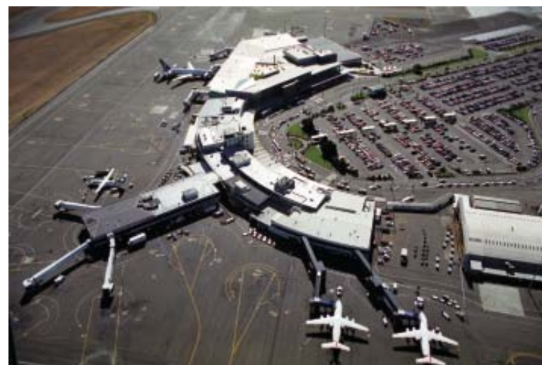
An aerial view of Christchurch International Airport.