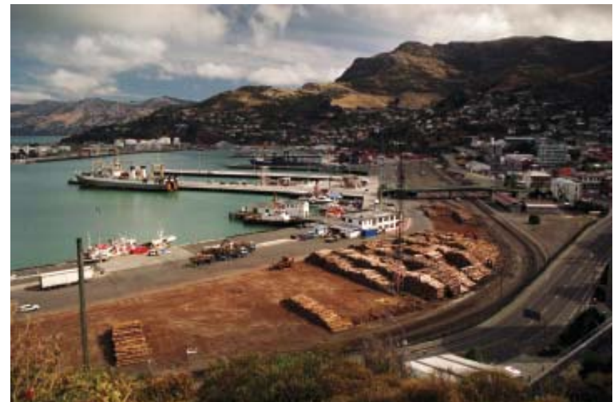
Scenes at the Lyttelton Port Company. Christchurch City Holdings Ltd holds the Council's shareholding in this company.