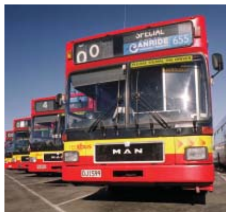
Scenes at the Red Bus Company. Christchurch City Holdings Ltd holds the Council's shareholding in this company.