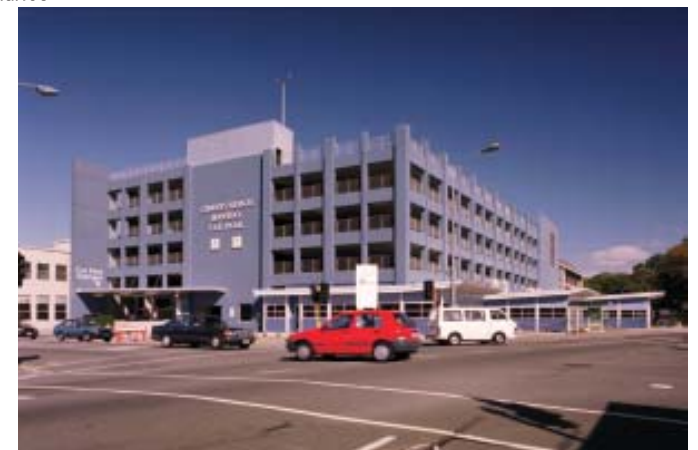
The Hospital Carpark building on the corner of Tuam Street and Antigua Street.