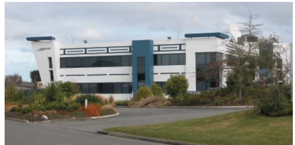
One of the buildings at the park.