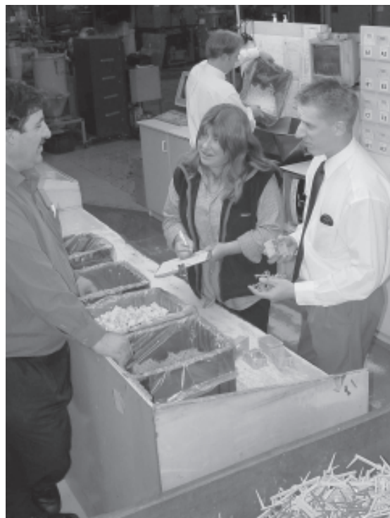
The Council's "Target Zero" waste reduction programme - helping businesses in reducing waste volumes

*(New performance indicators so no previous comparison available.)