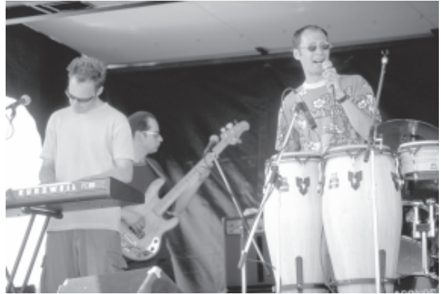
A concert band playing in the Square