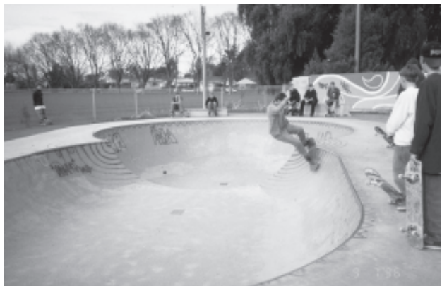
A skateboarder in action at one of the new skateboard facilities which the Council has been developing