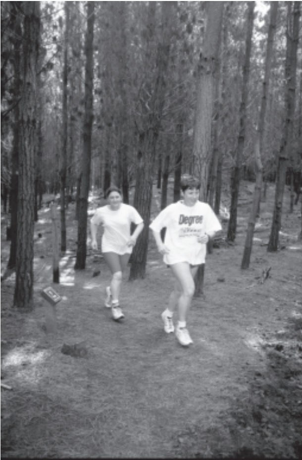
Joggers out enjoying the many tracks through Burwood forest