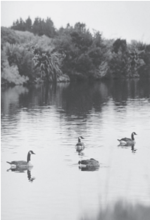
Some of the many thousands of waterfowl that frequent the wastewater oxidation ponds by the estuary

* Note that the increases from 1998/99 to 2000/01 for this performance indicator are due to increased operating costs of the Christchurch Wastewater Treatment Plant resulting from the capacity upgrade.