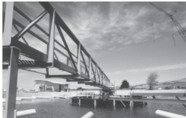
Work in progress at the Christchurch Treatment Works. This is part of the $33.75M capacity upgrade.