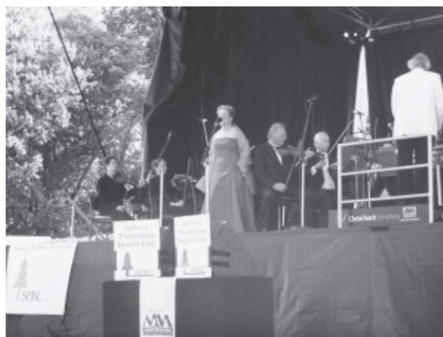
The Selwyn Plantation Board Ltd was a major sponsor of this concert which was held on 28 January 2001 in Darfield