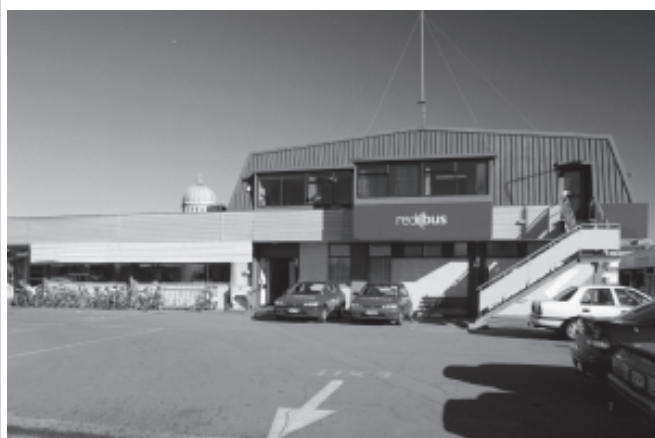
Scenes taken at the Red Bus Ltd Ferry Road Depot