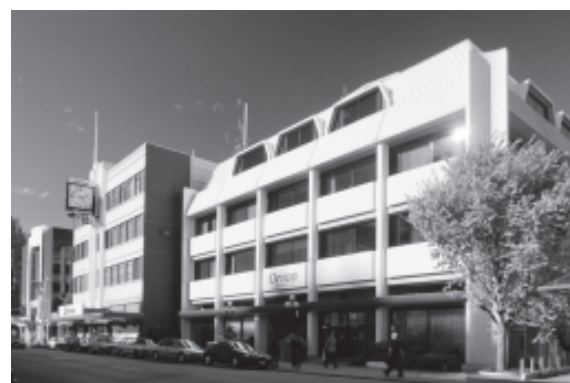
The Orion building in Manchester Street