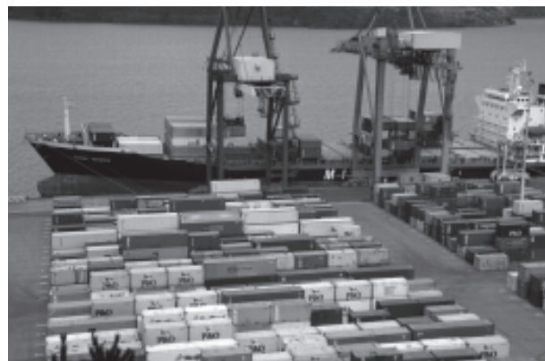
Views of the Lyttelton Port Company Container Terminal