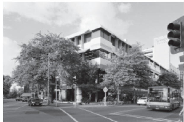
The Central Library from the Gloucester Street / Oxford Terrace Corner