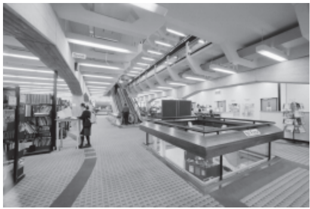
Inside views of the Central Library