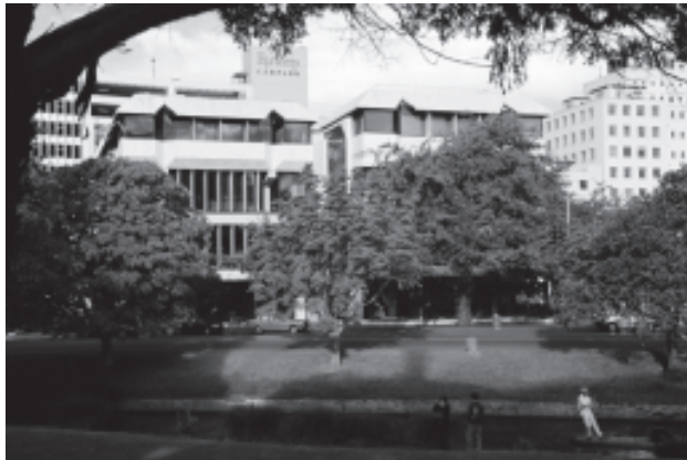
A view of the Central Library taken from the north bank of the River Avon