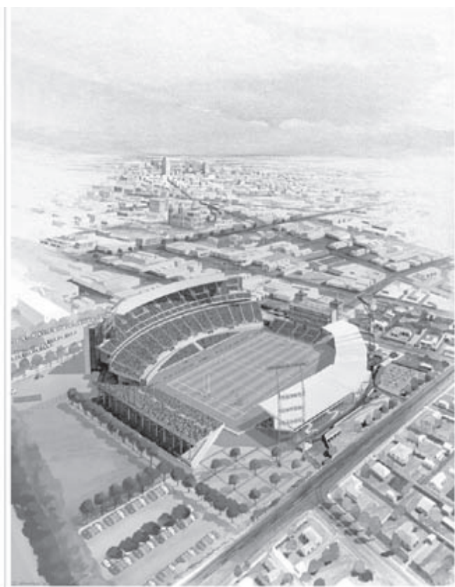
An artist's impression of the completed Jade Stadium