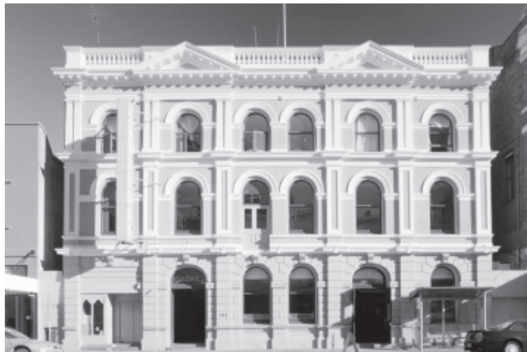
The recently painted old Coachman Inn in Gloucester Street. This is a heritage project which the Council has had a long involvement with.