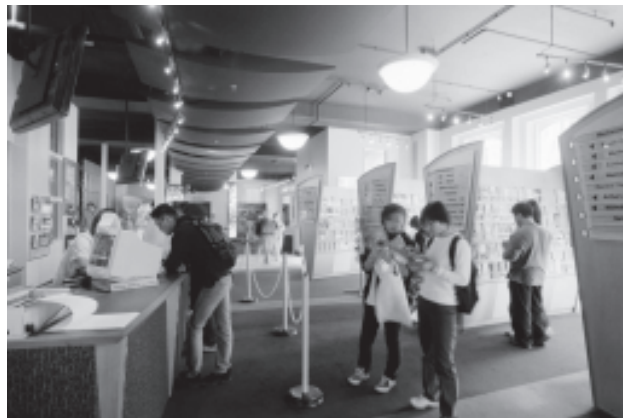
Another inside view of the Visitor Centre in the Old Post Office building