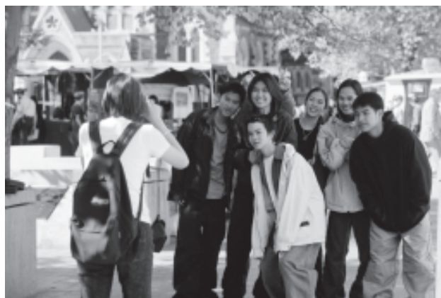
Visitors enjoying themselves in the Square