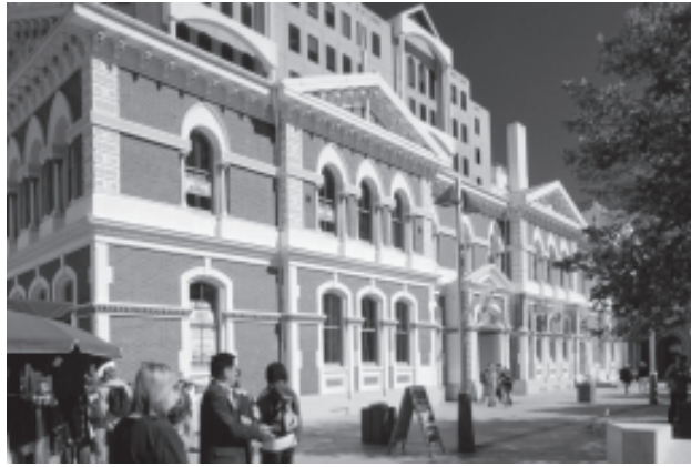
The Old Post Office building in the Square which now houses the Visitor Centre