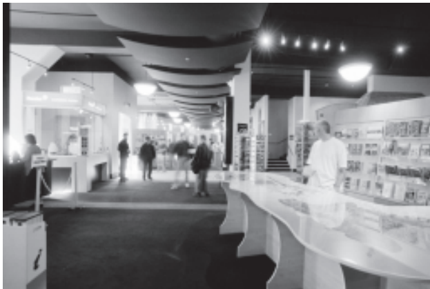
An inside view of the Visitor Centre in the Old Post Office building