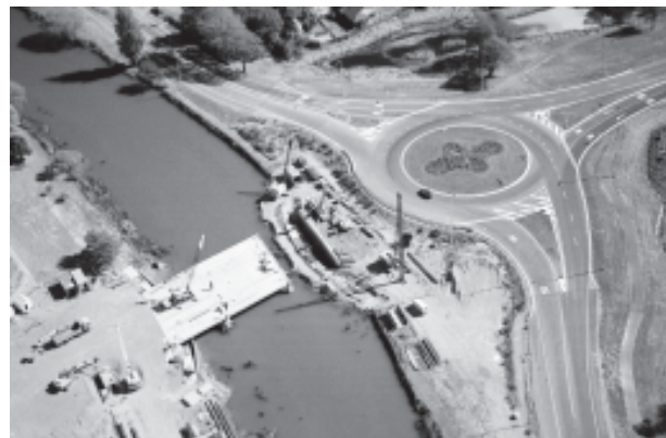
An aerial view of work in progress on the Woolston Burwood Expressway