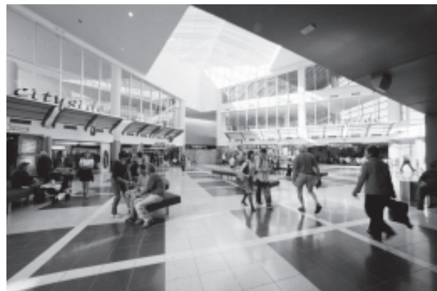
Two inside views of the recently completed terminal building project at Christchurch International Airport