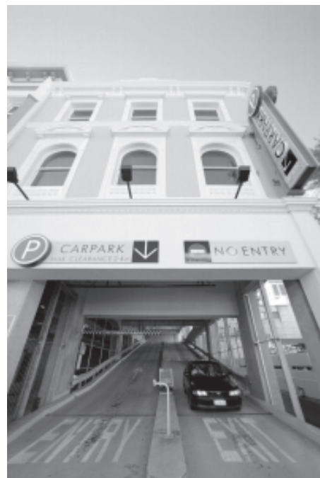
The entrance and exit to the new Bus Exchange Car Park