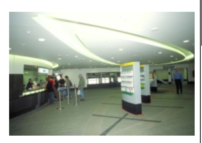
Different views of the new Bus Exchange