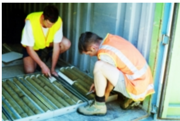
Geologists inspecting drill cores from site investigations