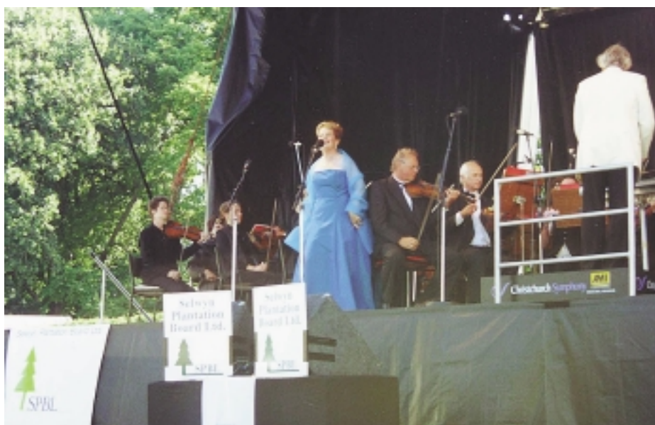
The Selwyn Plantation Board Ltd was a major sponsor of this concert which was held on 28 January 2001 in Darfield