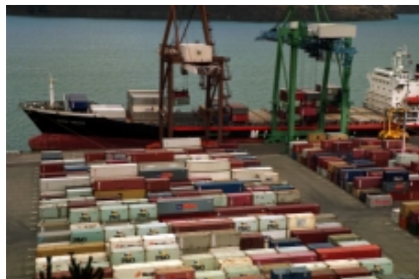
Views of the Lyttelton Port Company Container Terminal