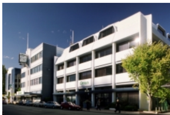
The Orion building in Manchester Street