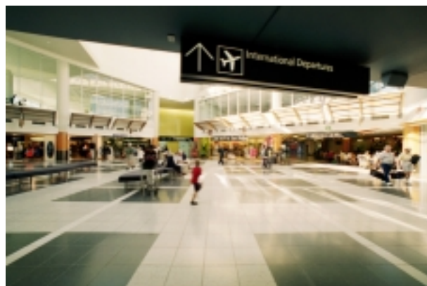
Two inside views of the recently completed terminal building project at Christchurch International Airport