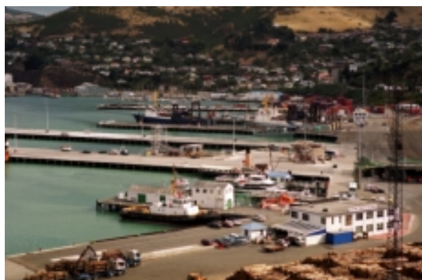
The Lyttelton Port Company facilities

Christchurch City Holdings Limited is a local authority trading enterprise, 100% owned by the Christchurch City Council. The Company was incorporated in May 1993. The Council retains control over the activities of the