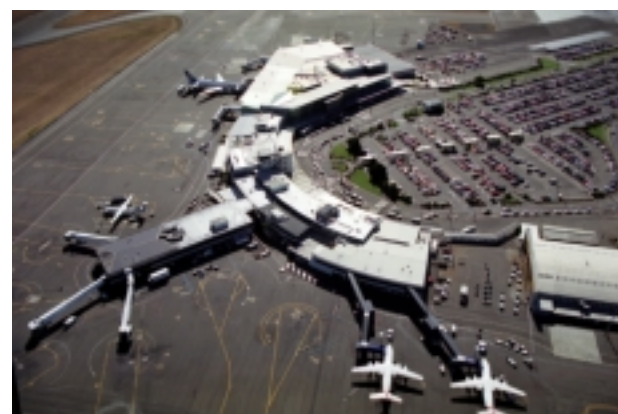
Christchurch International Airport Company terminal facilities from the air