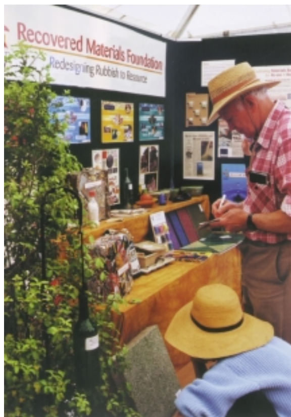
One of the many displays the RMF organises to show the use of "recovered materials"