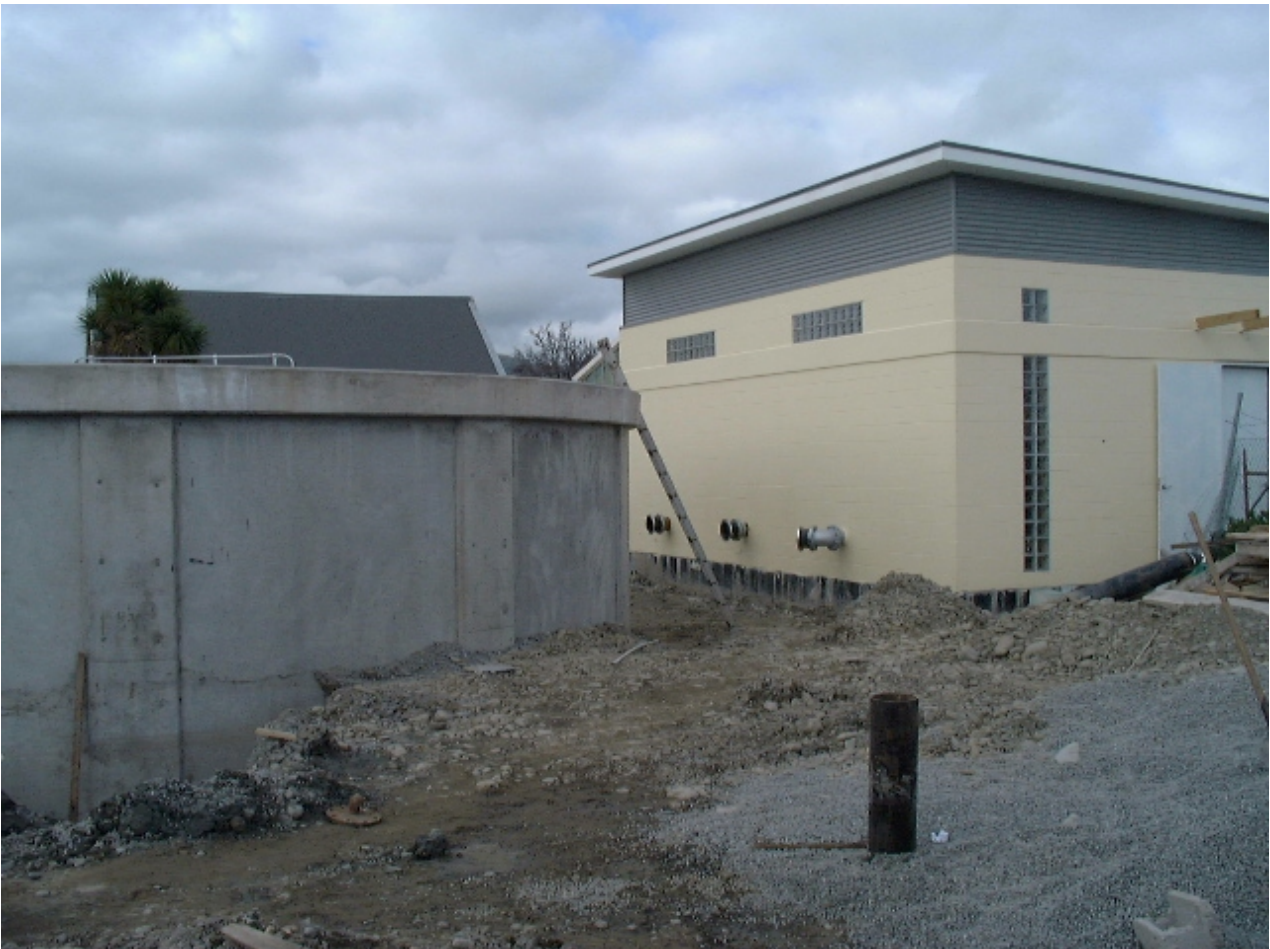
Construction of a new pump station and reservoir at Glenroy St, Woolston. The new pump station, reservoir and wells were completed in January 2001 as part of the Council's ongoing replacement programme, to replace the original station built in 1927.