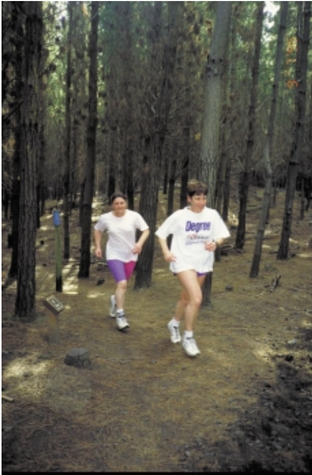
Joggers out enjoying the many tracks through Burwood forest