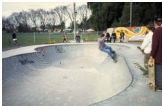
A skateboarder in action at one of the new skateboard facilities which the Council has been developing