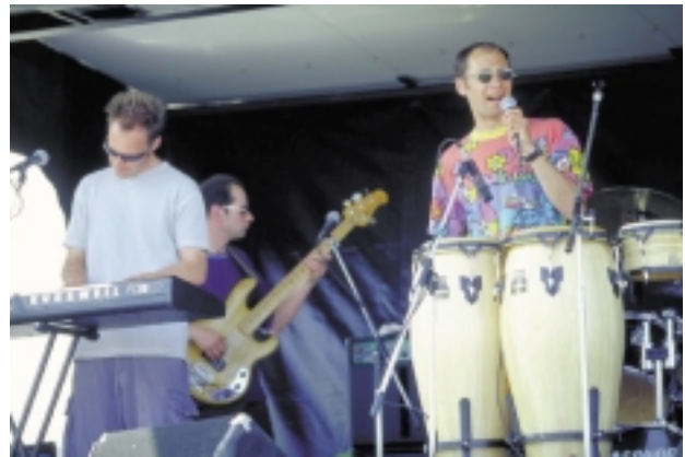
A concert band playing in the Square