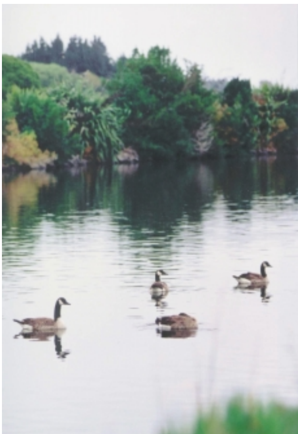
Some of the many thousands of waterfowl that frequent the wastewater oxidation ponds by the estuary

* Note that the increases from 1998/99 to 2000/01 for this performance indicator are due to increased operating costs of the Christchurch Wastewater Treatment Plant resulting from the capacity upgrade.