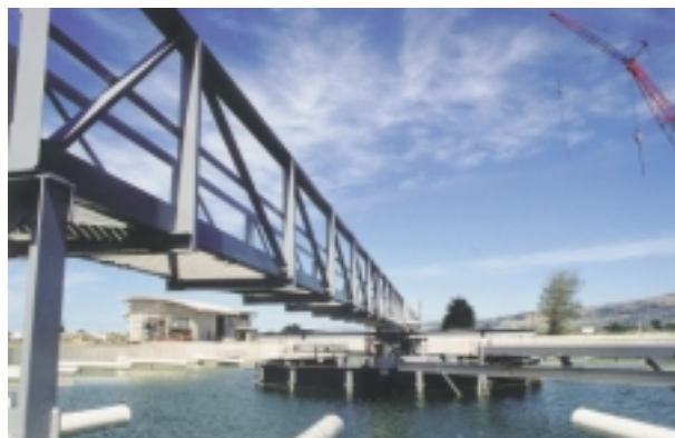
Work in progress at the Christchurch Treatment Works. This is part of the $33.75M capacity upgrade.