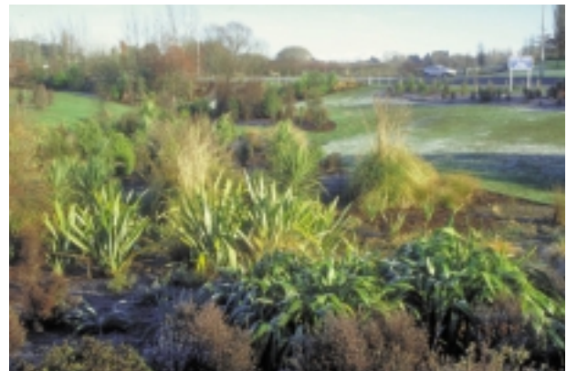
Waterway restoration project - Styx Mill Road/Regents Park