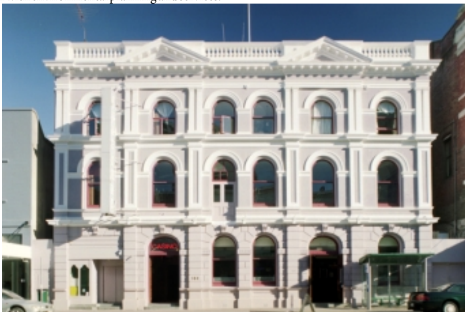
The recently painted old Coachman Inn in Gloucester Street. This is a heritage project which the Council has had a long involvement with.